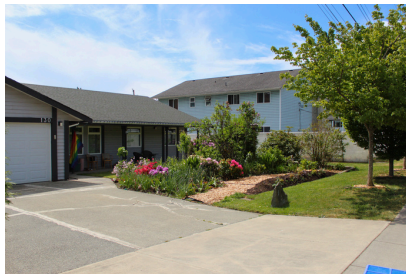
130 Burnett Road People's Choice Winner

We're excited to recognize the 2026 winners for People's Choice and Council's Choice: