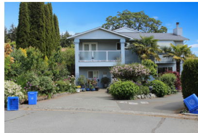
100 Paddock Place Council's Choice Winner

Council members will be delivering prizes to the winning addresses to celebrate their outstanding gardens. Congratulations to our winners and thank you to all participants for making View Royal bloom!